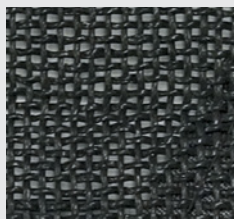
Super Tough Mesh