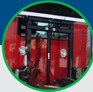
Tower & Integrated Housing